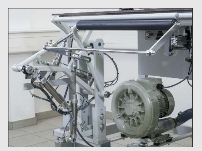
Quick and accurate de-stacking with the 201/6 stacker