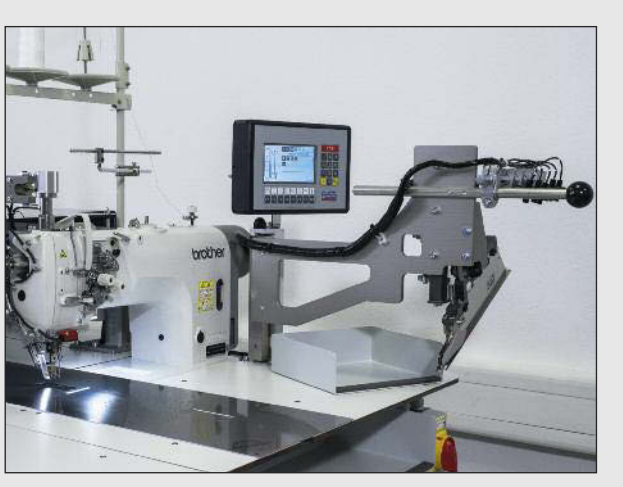
Easy access for service and set-up work