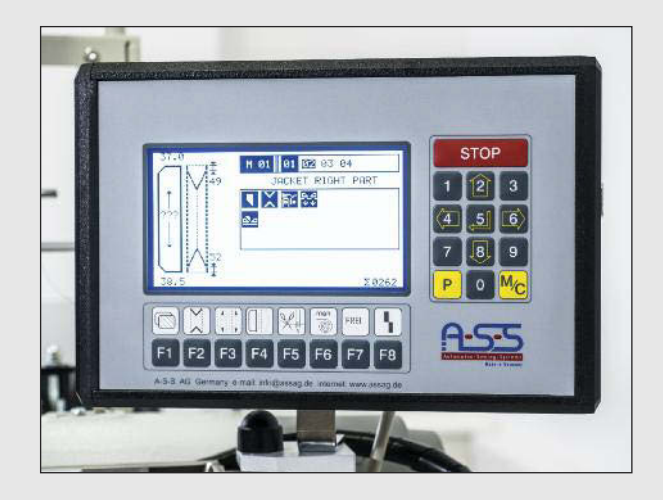
Easy administration and retrieval of the pre-programmed seams for diverse applications