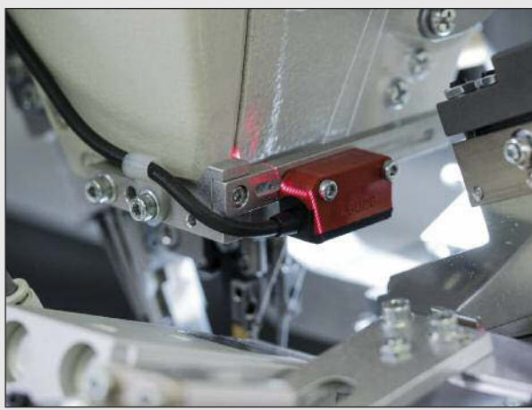
Flap sensing by photocell