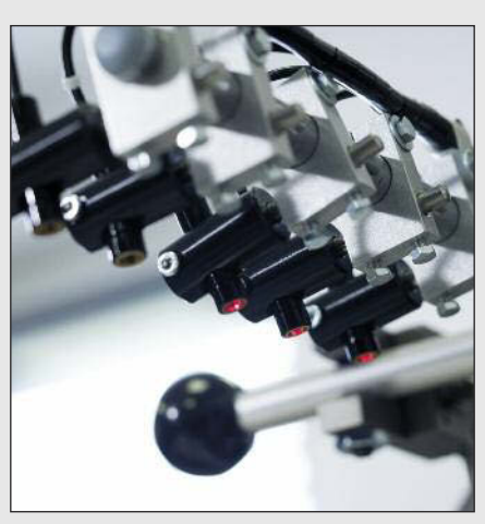
Accurate positioning with the help of the 5 position lamps