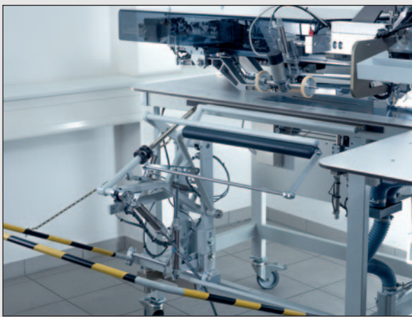
The ready-made parts are stacked automatically