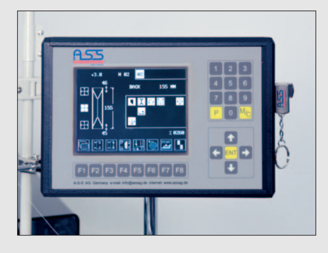
Easy preparation and administration as well as retrieval of the saved programs