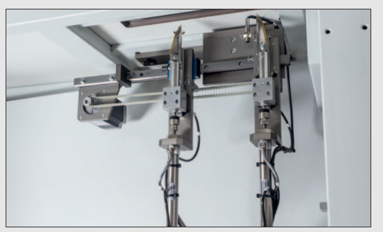
Cutter block with stepper motor drive