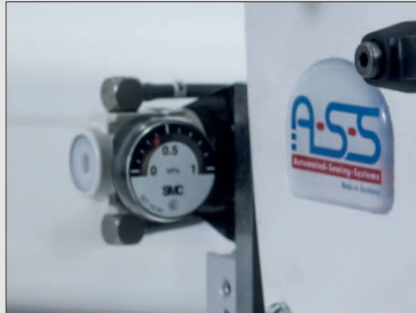
Manometer to adjust sewing foot pressure

Working Station for endless zipper operation special for car cover