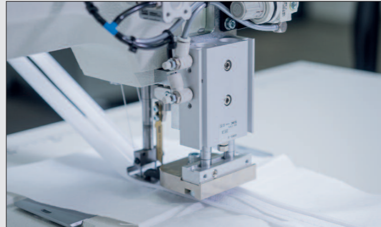
Pneumatic presser foot lifting