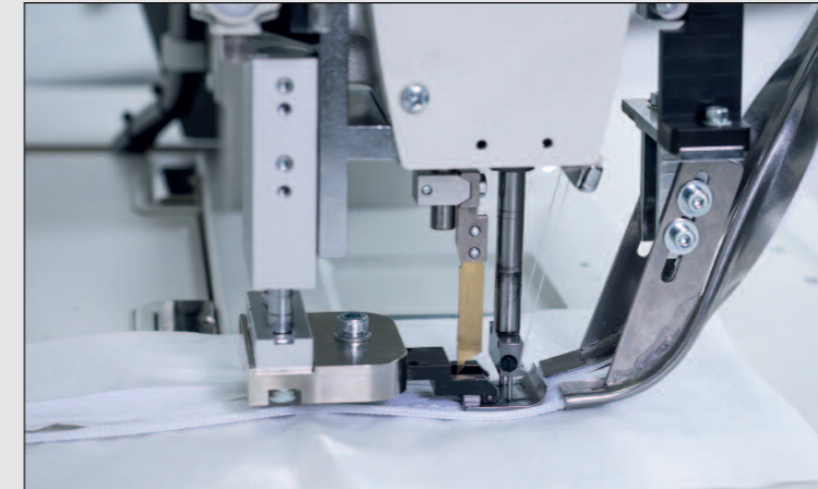
Center knife for cutting the fabric and zipper guide