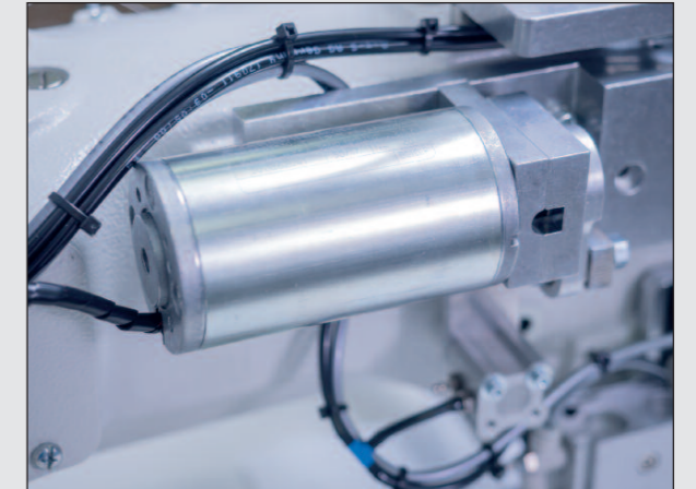
Variable speed of center knife motor